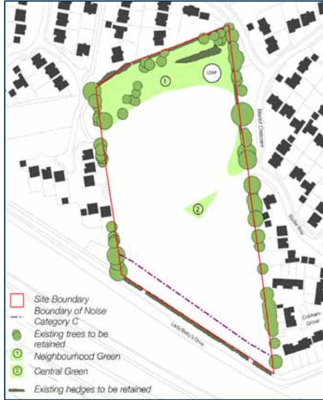
The Landscape Strategy