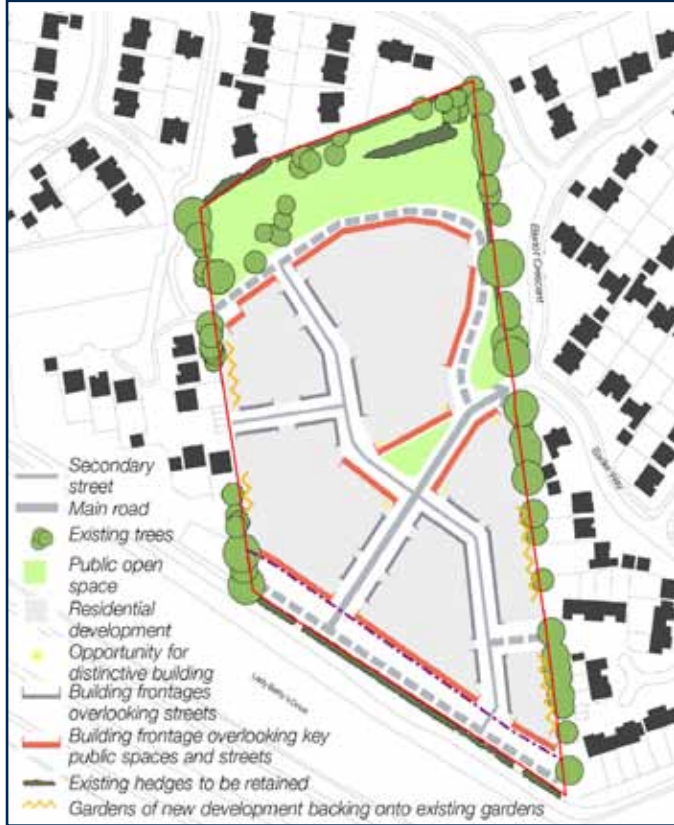
The Urban Design Principles